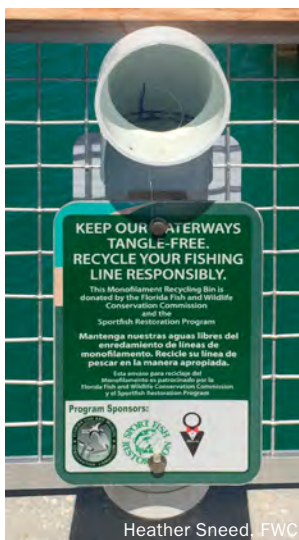
Heather Sneed, FWC